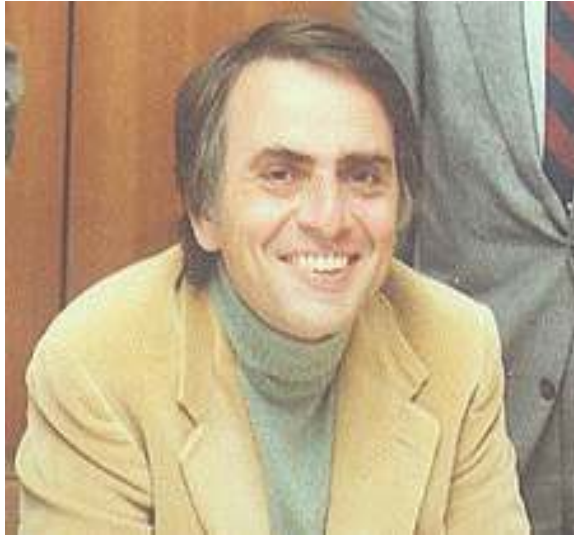
Carl Sagan - 11/9/1934 - 12/20/96

This leaflet is excerpted from a commencement address delivered May 11, 1996. Carl Sagan, Ph.D.