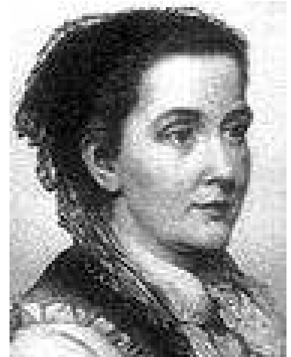
Julia Ward Howe 1819-1910

In 1872, in reaction to the carnage of the Civil War, Julia Ward Howe, a Boston poet, pacifist, suffragist, and author of the lyrics to the "Battle Hymn of the Republic," organized a day encouraging mothers to rally for peace and against war , since she believed they bore the loss of human life