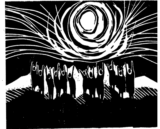
The Beloved Community - MLK

Comments: 202-456-1414, www.whitehouse.gov/contact/