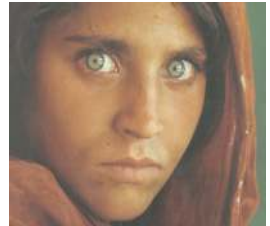
A Young Afghan Woman

Last week, President Obama announced his decision to send 17,000 additional U.S. troops to Afghanistan, on the grounds that "the situation in Afghanistan and Pakistan demands urgent attention." This will bring U.S. troops numbers to 55,000. The U.S. commander there said that he still needs an additional 10,000 troops. He also said, U.S. forces will be in Afghanistan up to five more years. That makes 13 years in total: 2001 - 2014. When will it end?