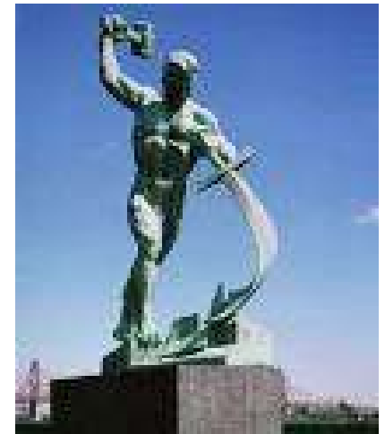
Swords into Plowshares

On Aug. 6, 1945, and again on August 9, the US government dropped atomic bombs on the Japanese cities of Hiroshima and Nagasaki. In so doing, the US murdered over 100,000 thousand men, woman and children.