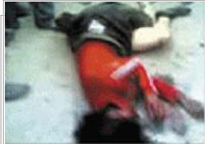
Kurdish girl stoned to death

The situation is even worse than that, however. With the change in the Iraqi Constitution, articles that protected the rights of women were eliminated. Now discrimination against women is, indeed, "honorable," is "religious," is legal.